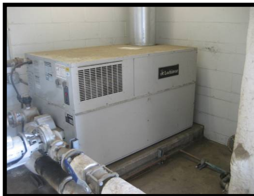
(OLD) heating boilers