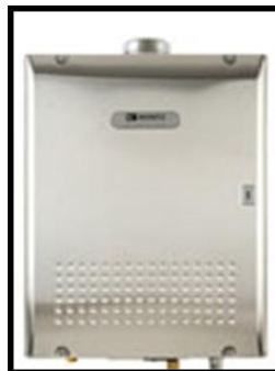
Tankless water Heaters